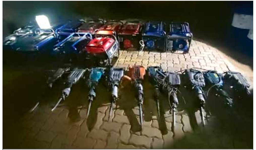
The illegal mining equipment that was confiscated by the police during disruptive operations in Apel area.

The members of the Limpopo Provincial Police Illegal Mining Task Team, together with Provincial Organised Crime Unit, have confiscated illegal mining equipment valued at R67 000-00 during disruptive operations conducted at separate locations under Apel Policing area in Sekhukhune District. During these operations, three illegal immigrants were also apprehended at Zeekoegat Mountain Farm. "Police were conducting an operation when they noticed a group of people busy with illegal mining activities at the mountain and immediately pounced on them. The suspects started to run away into different directions after noticing the police and three were immediately nabbed while others managed to evade an arrest," said Colonel Malesela Ledwaba, Limpopo Provincial Police Spokesperson. Ledwaba said during the arrests, the police seized illegal mining equipment comprising of a generator, jackhammer and three shovels of the three undocumented Zimbabwean nationals. Ledwaba said the police proceeded to GaPhasha Village continuing with the operations and found another group of illegal miners who