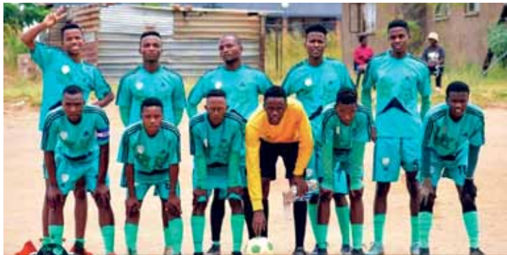
Dikotope Sports Academy from Dennilton, Elias Motsoaledi Local Municipality, are among teams gunning towards participating in the Sekhukhune Regional Playoffs.