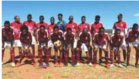
Real Borthers FC from Radingwana Village in Fetakgomo-Tubatse Local Municipality is one of the teams doing well in Stream D of the regional competition.